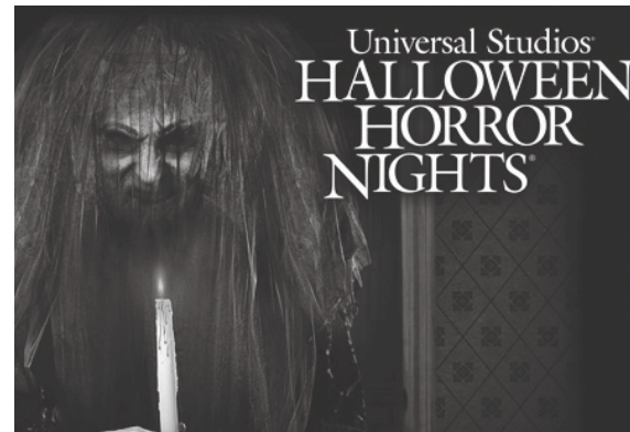
A-MAZE-ING: The Insidious maze is attracting crowds at Horror Nights

The park includes scare zones, special places in the park where horror awaits. This year there are five different scare zones: The Curse of Chucky, The Purge, Walking Dead, Scarecrowz, and Cirque Du Klownz.