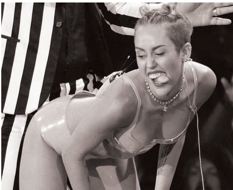
MILEY CYRUS: Miley Cyrus' performance at the VMA Awards outraged the public and frightened off even the most-dedicated of her fans.

Miley seems to have decided that because she did not have a complete childhood, seeing as she was so busy being on television, she has used her spotlight today, to make a complete fool of herself and be an immature young adult. In all honesty, this was the perfect plan to get everyone talking about her and realize that she is no longer the child persona she has been so desperately trying to escape. So pat yourself on the back Miley, you have America just where you want us.