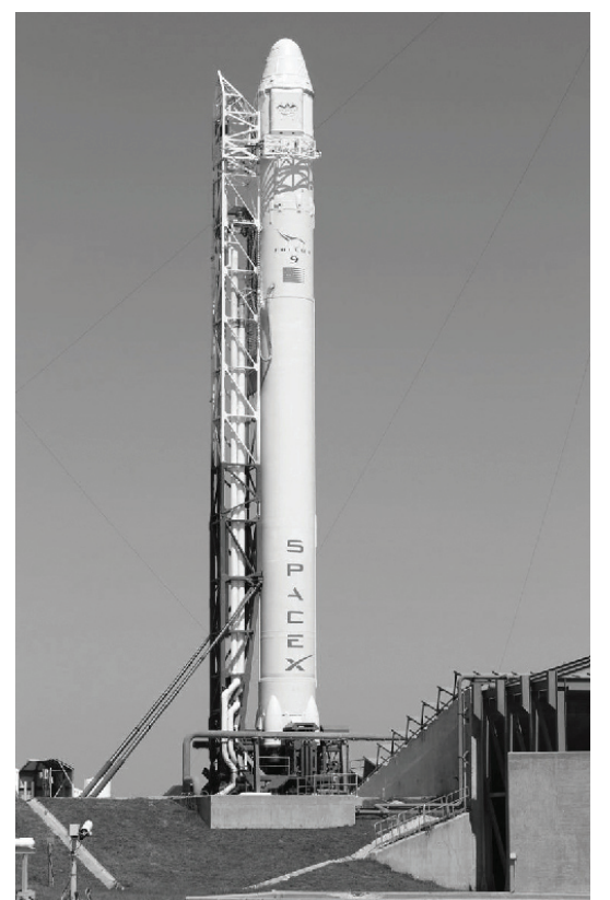
READY FOR TAKEOFF: SpaceX is manufacturing spacecrafts for further use

If scientists and entrepreneurs can collaborate and conjure more out-of-the-box ideas the near future will reveal previously unthinkable creations that will defy the current understanding of what is possible.