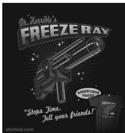
TIME FREEZE: Cold-hearted Boehner makes the government shrivel up.