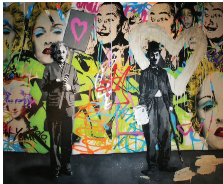
THIERRY GUETTA (AKA MR. BRAINWASH): Displayed above is a picture of Guetta's street art.

Art is a highly difficult aspect of today's pop culture society to gauge, and much to the public's surprise, a shocking amount of art pieces can be manipulated by artists and sellers to make art purchasers believe that what they are buying is of value. Perhaps Guetta's art truly is one of a kind but he may also be purely a critical depiction of the art world today and a prime example of the gullibility that people adapt in order to stay trendy.