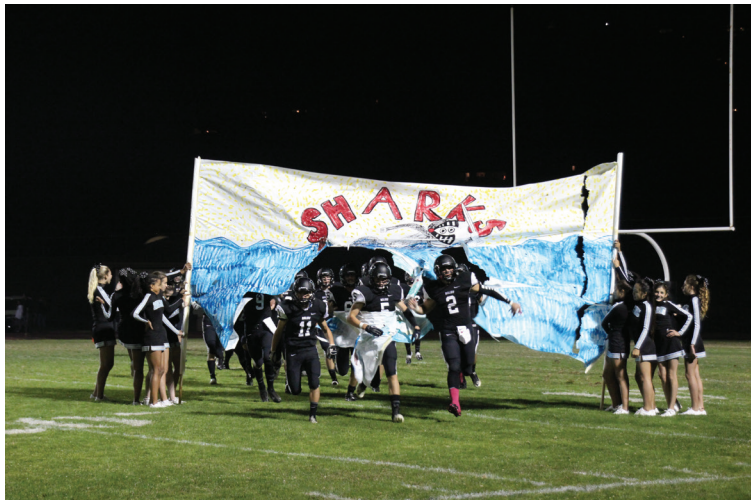
SHARK ATTACK: The Sharks get pumped up for their game with a wild entrance.