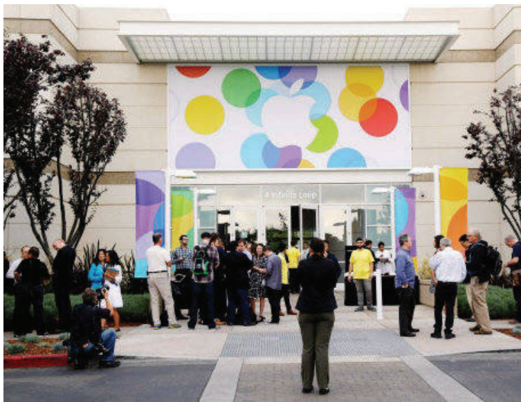
APPLE HEADQUARTERS: People gather the day of the announcements of the new products