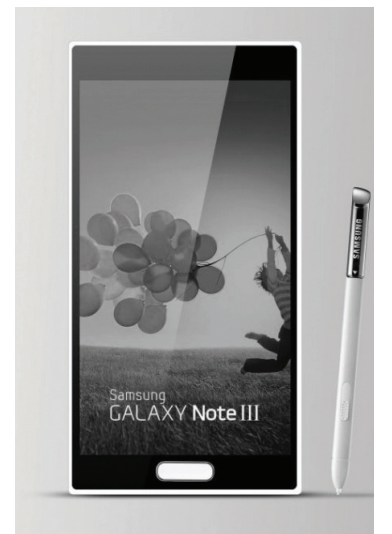
NOTE-WORTHY: The Samsung Galaxy Note III comes with many tech innovations.

The Samsung Galaxy Note III debuts this holiday season for $299. Expect to see a new lineup of commercials starring LeBron celebrities using this device streaming over the next few months.