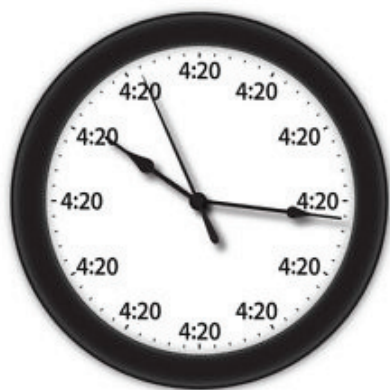
CLOCKS: The very first clock ever discovered, 2001 B.C.

or not we should be listening. I was appalled to find nothing but a grave at the address I was given.