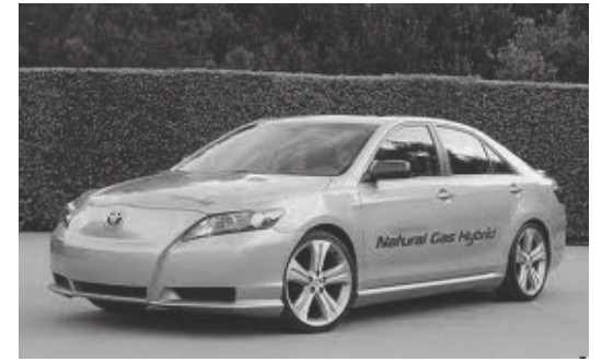
AU NATURAL: Natural gas powered cars are making their debut in the opinions of many students.

Natural gas powered cars may be good for all reasons, but fueling these cars poses many problems for Americans. Currently, there are only 12,541 stations that supply fuel for natural gas powered