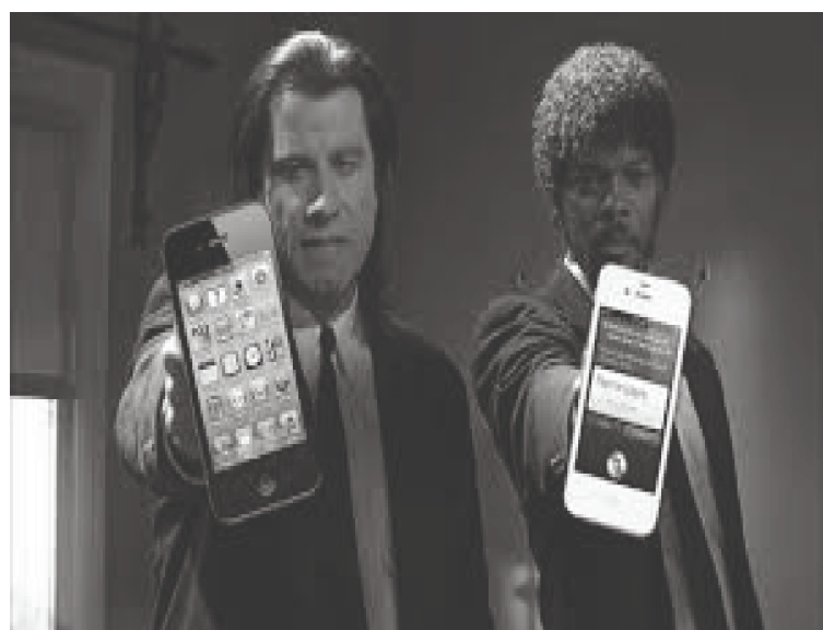
PULP FRICTION: Famous actors display thier fancy iphones.

For those iPhone/iPad users who find themselves unhappy with the new update, hopefully some of these tips and hints made life with iOS7 a little better.