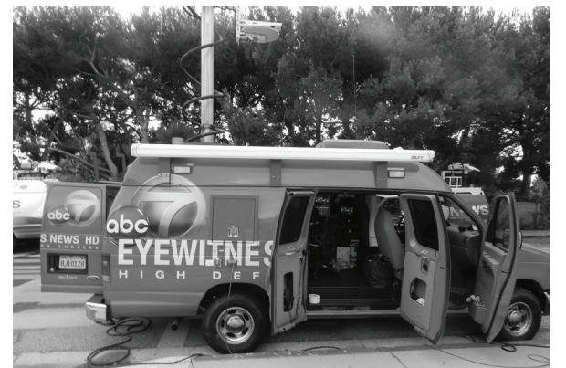
NEWS VANS: One of many news cars that surrounded MHS.

tial scare has boiled over, classes are returning to normal, although no classes are being held in the middle school building, still. While the media made this story well known, it seems to have just been blown out of proportion. With initial reports showing that things are normal, students are returning to school and parents' fears are being quelled.