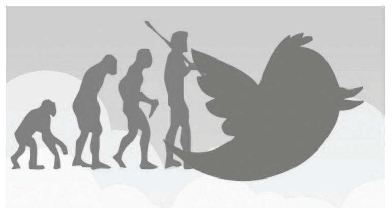
SOCIAL EVOLUTION: Twitter remains in one of the top spots in the world of social media mediums.

Check out the NEW website www.mhscurrent.com