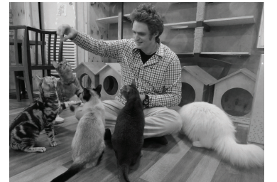
CAT CAFE MAYHEM: Even guys can not resist the cuddly and fun experience that is a cat cafe.

Certain people were left wondering if the café's were a health hazard and speculate about the hygiene aspects of these cafés, but Gandelon reassured that in her café, there is a separate litter box room, and cats aren't allowed