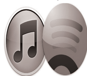
ITUNES VS. SPOTIFY: iTunes triumphs over Spotify, hands-down.

Personally, I prefer using iTunes because it's more reliable, and is better quality. The obvious choice to me would be iTunes but, for some reason, people still love-using Spotify. It seems that the reason why so many people like Spotify over iTunes is because it is a lot cheaper.