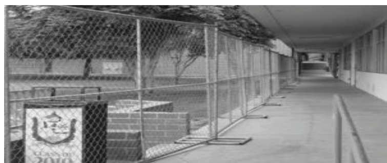
SCHOOL CONTAMINATION: Over the summer, MHS did construction over the lawn and removed soil.

tial scare has boiled over, classes are returning to normal, although no classes are being held in the middle school building, still. While the media made this story well known, it seems to have just been blown out of proportion. With initial reports showing that things are normal, students are returning to school and parents' fears are being quelled.