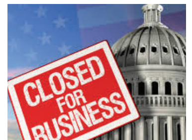
SHUTDOWN NOTICES: Images like this appeared all over the internet during the 17 day shutdown.

On October 16 th , after the federal government had been shut down for over two weeks, the United States Congress passed a bill to end the shutdown. This bill raises the federal debt ceiling, allowing temporary relief to the conflict in the House of Representatives and the Senate. Hopefully Congress will be able to make suitable changes in order to prevent an economic crisis like this from occurring again.